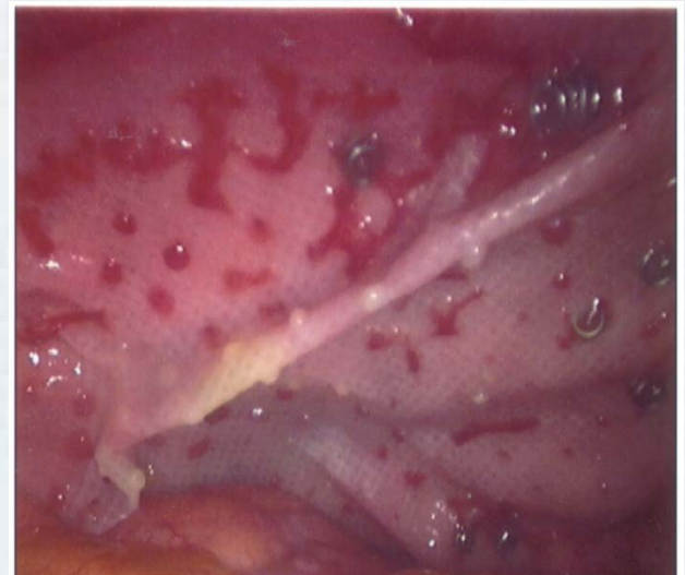
75 day laparoscopic re-look of a ventral hernia repair with SURGIMESH XB in a gastric bypass patient.

Visceral Contact: the XB Tintra configuration of SURGIMESH possesses a very thin (~0.2 mm) layer of integrated medical grade silicone elastomer on one surface to minimize visceral tissue attachment in laparoscopic and open minimally invasive hernia repairs. The silicone surface, being a permanent barrier to tissue attachment, provides consistent minimization of tissue attachment 3) long term. This is shown in the picture to the right where the visceral surface of a ventral hernia repair performed with SURGIMESH XB demonstrates secure healing to the abdominal wall with no visceral adhesion formation after 75 days 4) . With the XB Tintra configuration the peritoneal surface has small 1 mm holes for serous drainage post operatively. These holes heal over early in the post operative period. Clinical feedback on use of SURGIMESH for minimally invasive hernia repair has found the mesh to provide superior handling and ease of use for surgeons while demonstrating improved patient comfort and outcome 1, 3, 4) in open and laparoscopic hernia repairs.