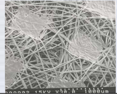
Non-woven, microfiber structure of SURGIMESH material.

Material and Structure: a next generation non-woven, microfiber polypropylene mesh for all types of hernia repair available in two configurations: WN for non-visceral contact mesh repairs and XB for visceral contact mesh repairs. Being a low weight mesh with a high degree of flexibility and a reduced thickness of ~0.5 mm, SURGIMESH provides ease of handling and maneuverability during surgical procedures along with superior patient comfort and lower complication rates long term 1) . Due to its non-woven nature and small fiber size (0.02 mm - up to 10 times smaller), SURGIMESH presents an appropriately sized interconnecting pore structure which results in low levels of inflammation and completeness of incorporation in very short periods of time. Composed of a random network of high strength fibers, SURGIMESH exceeds FDA reviewed mesh strength levels.